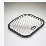
AC7320 Utility Tray