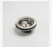
AC09 Basket Waste