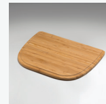
AC74 Bamboo Board