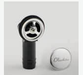
Overflow Round with Cover